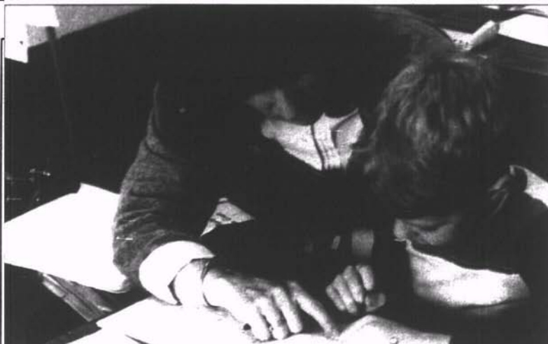
Corrections and feedback: "I check your notebooks for dates, formation of letters, neatness and content of what is written. I record a plus sign if they are correct and reteach if they are not."

tion and help teachers to focus and avoid confusing digressions.