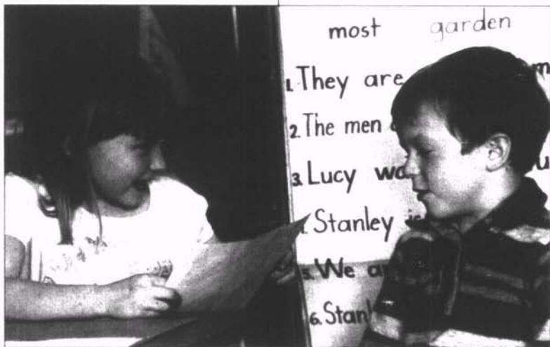
Independent practice: "You will take a pupil partner spelling test."