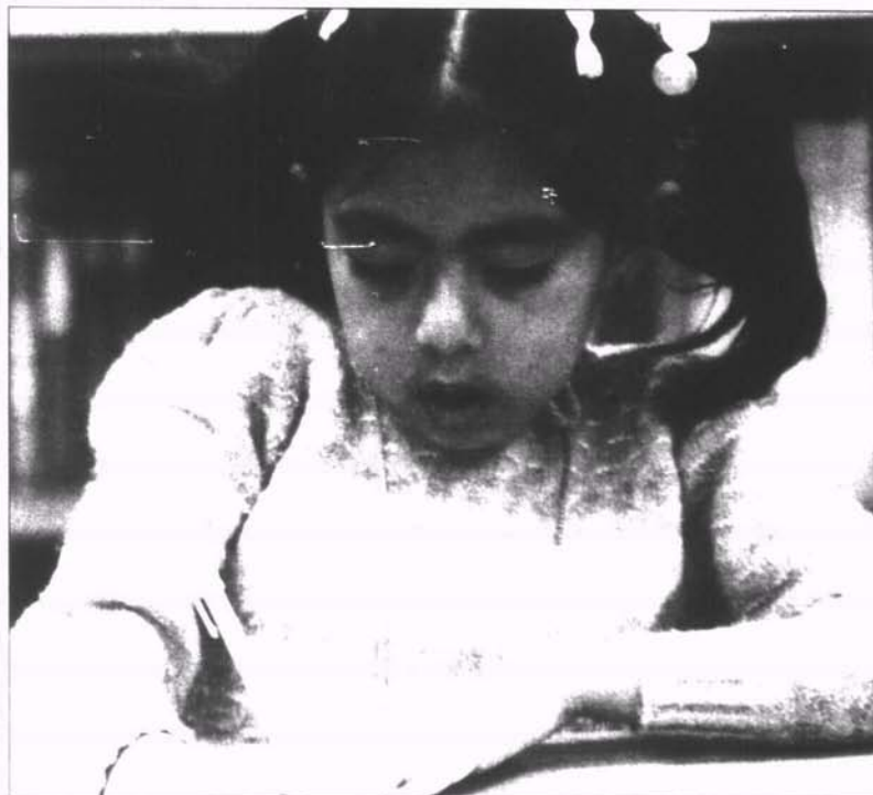
Independent practice: "Write so readers can share an experience."

Students receive help during initial steps, or overview Practice continues until students are automatic (where relevant) Teacher provides active supervision (where possible) Routines are used to give help to slower students