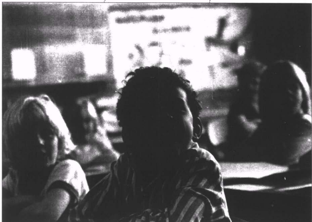
Guided practice: "Read with me ways you can judge if the information you read could be fact."

sion. But even for these situations, it is more efficient to return to small-step instruction when the material becomes difficult.