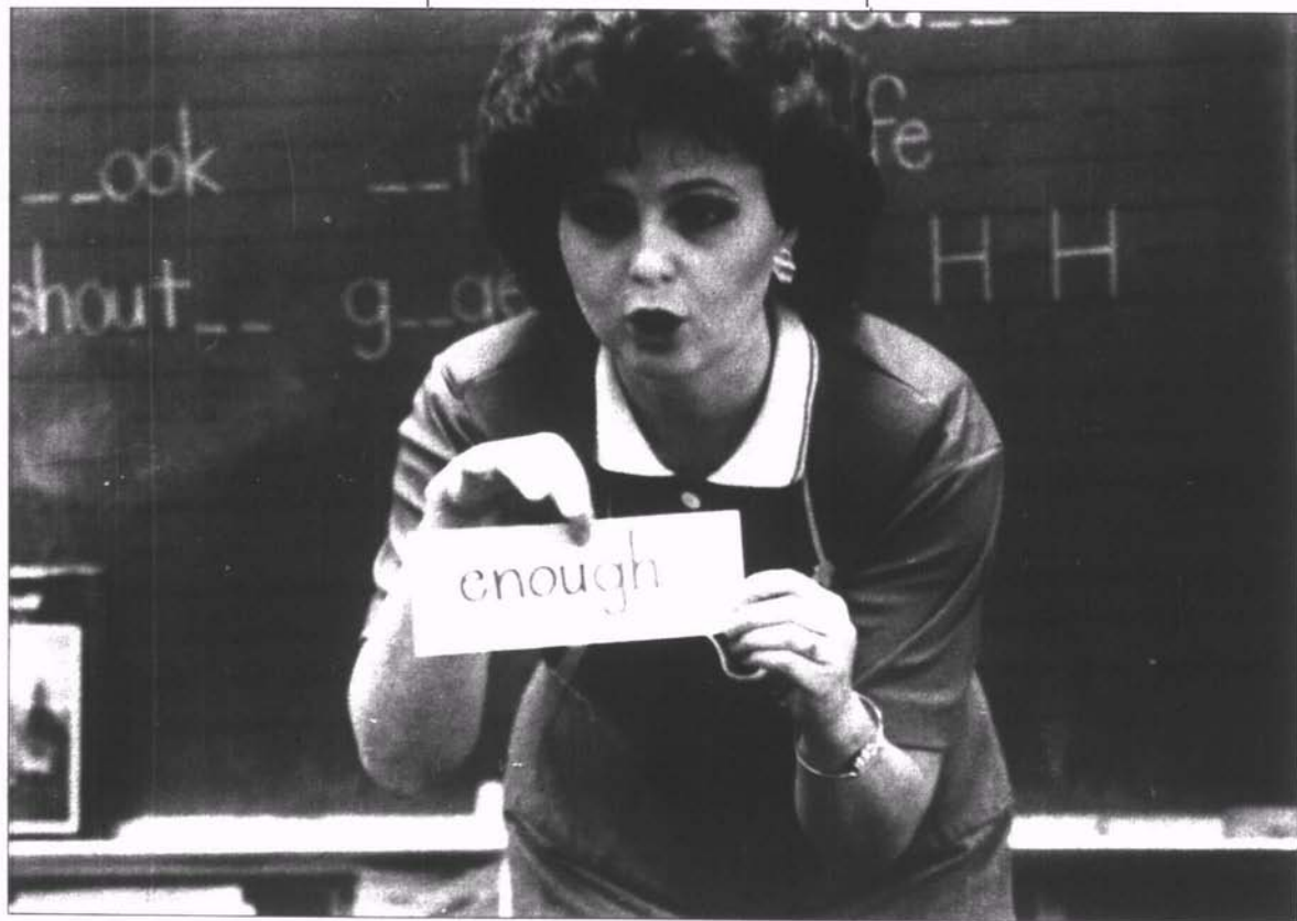
Presentation: "You will learn a new word..."

Use and limits. It would be a mistake to say that this small-step approach applies to all students or all situations. It is most important for young learners, slow learners, and for all learners when the material is new, difficult, or hierarchical. In these situations, relatively short presentations are followed by student practice. However, when teaching older, brighter students, or when teaching in the middle of a unit, the steps are larger; that is, the presentations are longer, less time is spent in checking for understanding or in guided practice, and more independent practice can be done as homework because the students do not need as much help and supervi-