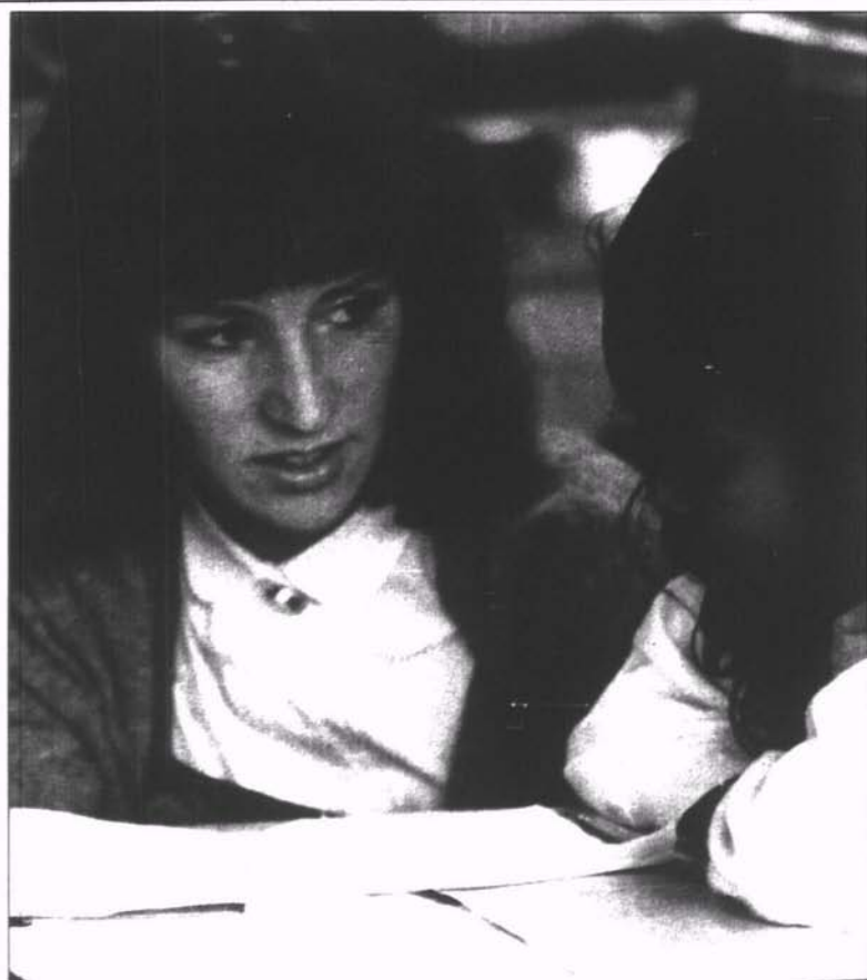
Corrections and feedback: "To check the accuracy and rate of reading words, practice reading the test aloud accurately and as fast as possible while you time yourself."

fer it from our working memory to our long-term memory. That is, we have to elaborate, review, rehearse, summarize, or enhance the material. Students can do this through active practice, which is facilitated if the teacher asks questions, requires students to summarize main points, has students tutor each other, and supervises students as they practice new steps in a skill.